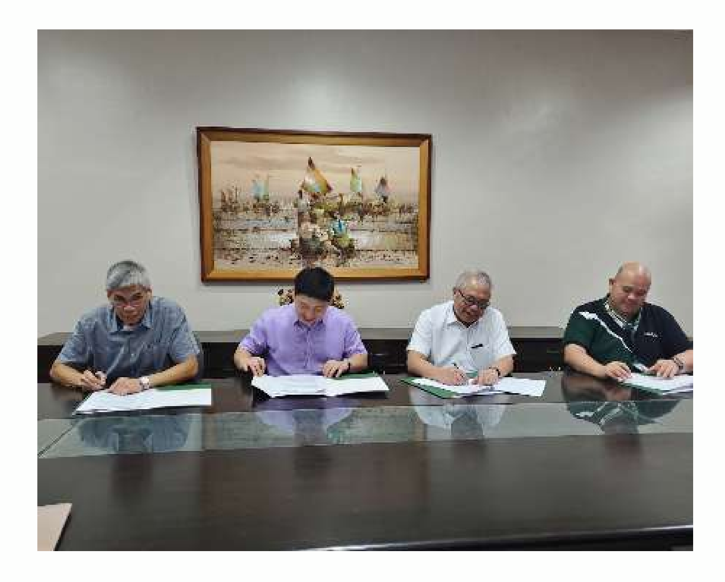
MOU signing held at the Chancellor's Conference Room last January 9, 2024