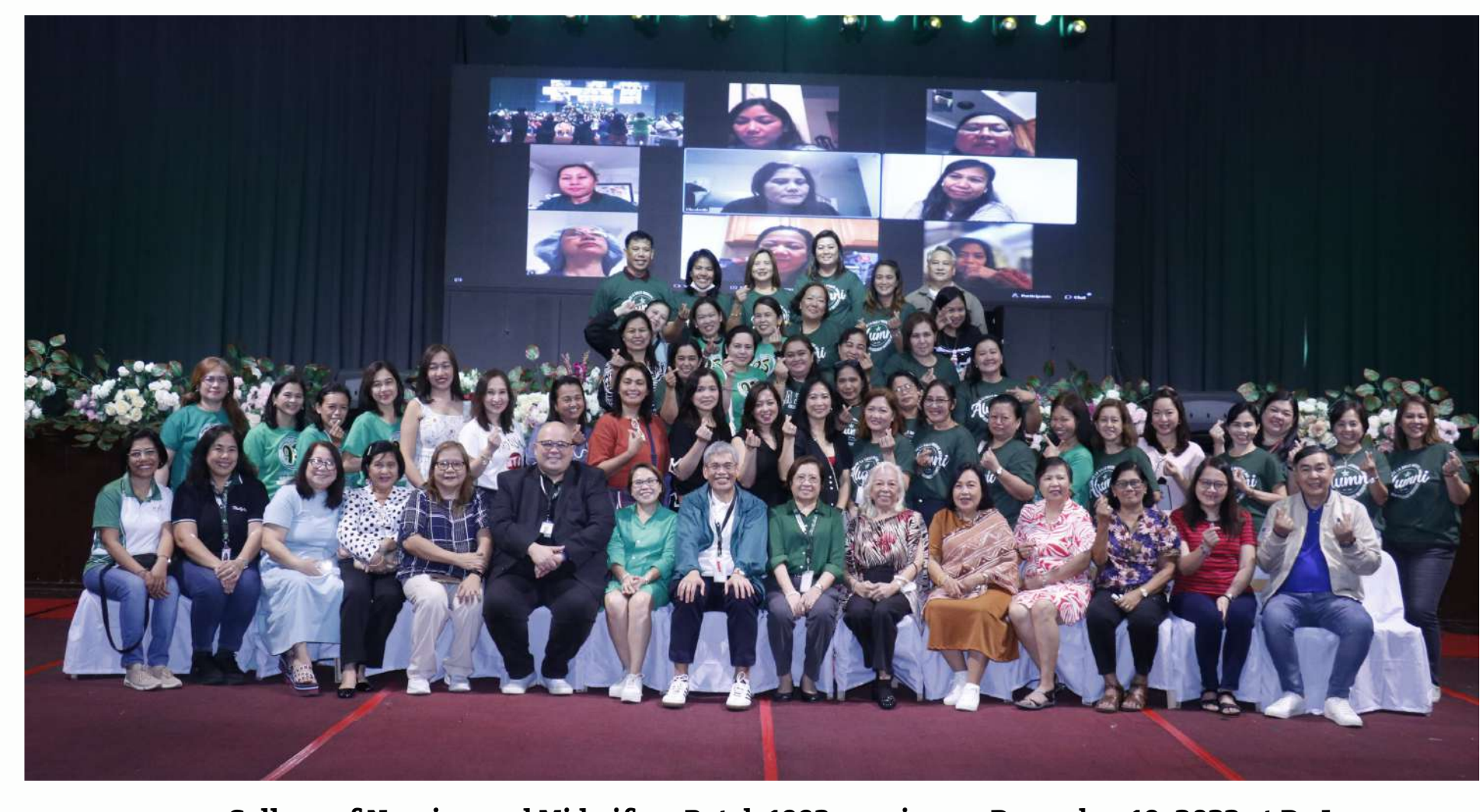
College of Nursing and Midwifery Batch 1993 reunion on December 19, 2023 at De La Salle Medical and Health Sciences Institute- Animo Center

friendship, 2023, brought shaped their academic journey. to excellence and service. Campus, where alumni were program greeted by familiar sights and guests, including years. Salle Medical and Health professionals.