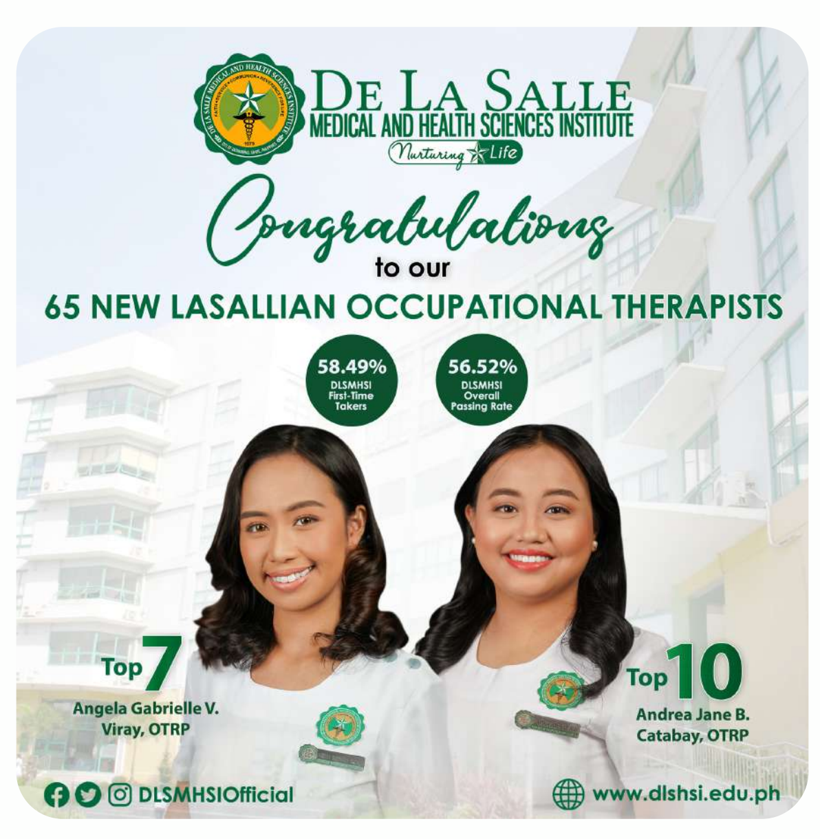
Poster from DLSMHSI Facebook Page