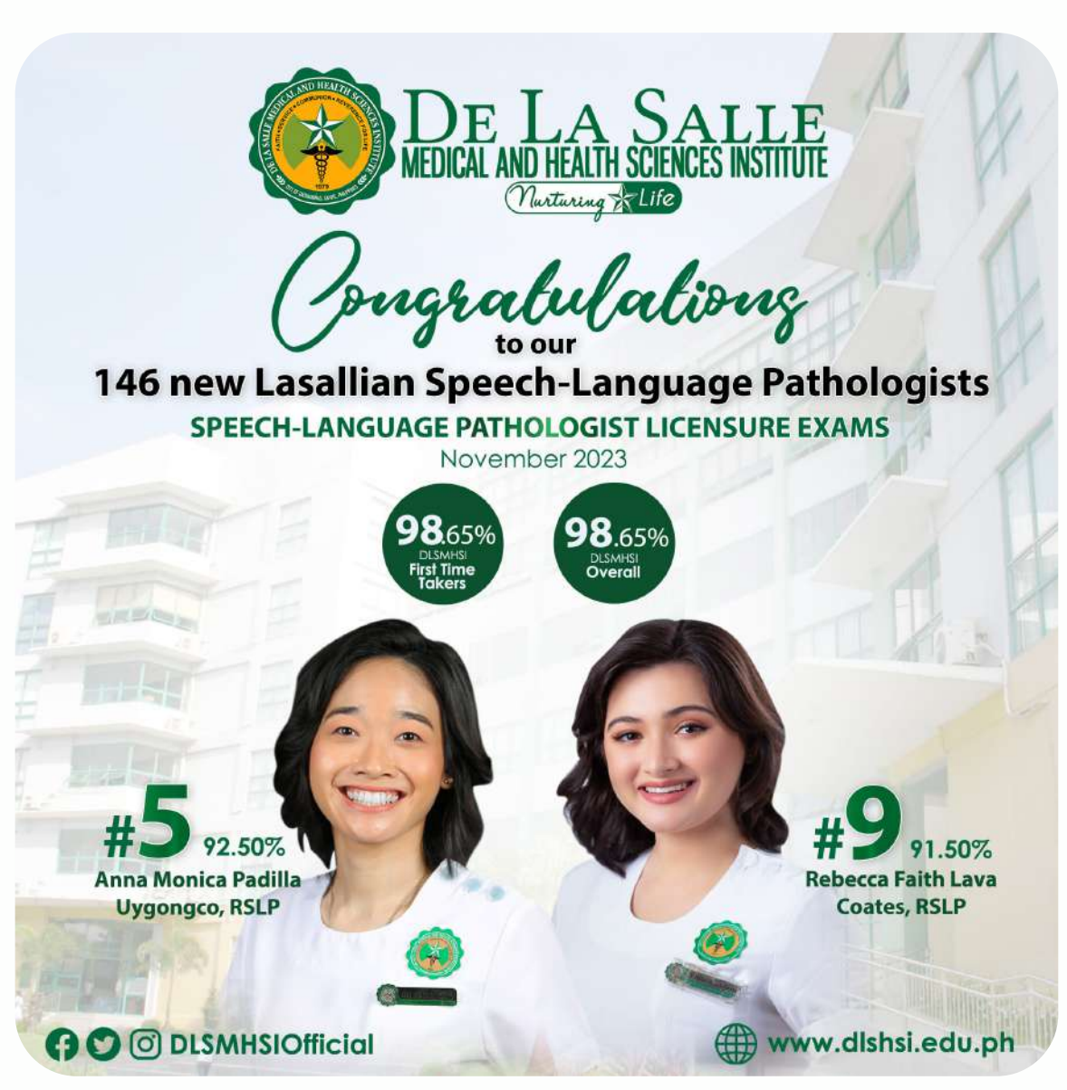
Poster from DLSMHSI Facebook Page