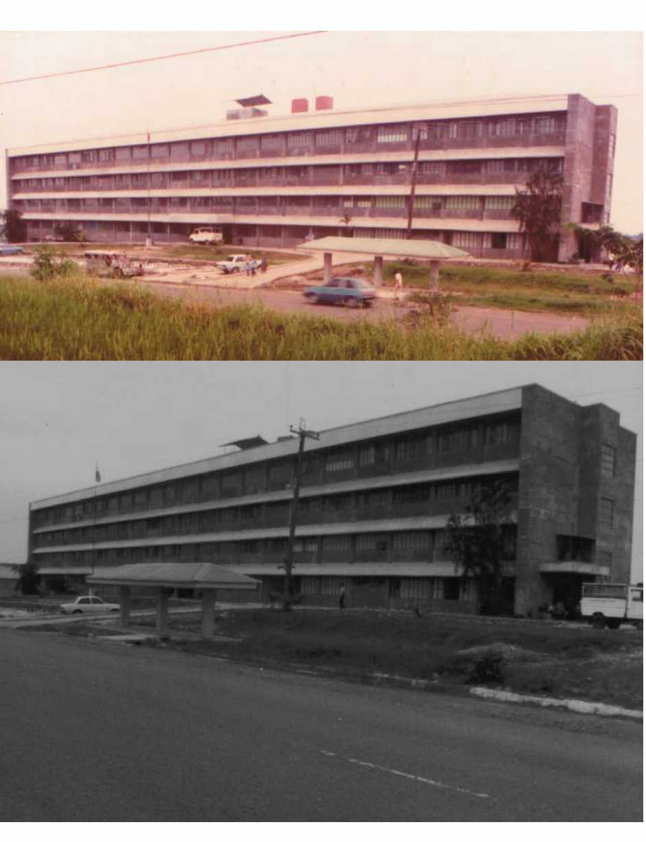
The former University Medical Center

In alignment with the newly released and revised DLSMHSI Mission-Vision, the President envisions the entire DLSMHSI community as the Preferred Preferred Hospital, School, Preferred Research Center, and the Preferred Employer. This vision propels the whole community towards excellence in healthcare, education, research, and employment practices. By fostering a culture of innovation, collaboration, and continuous improvement, DLSMHSI strives to not only meet but exceed the expectations of its stakeholders.