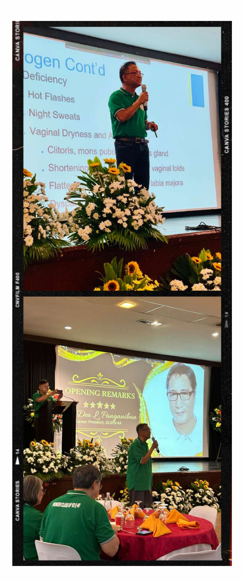
Highlights of College of Medicine 40th Year Celebration on December 6, 2023