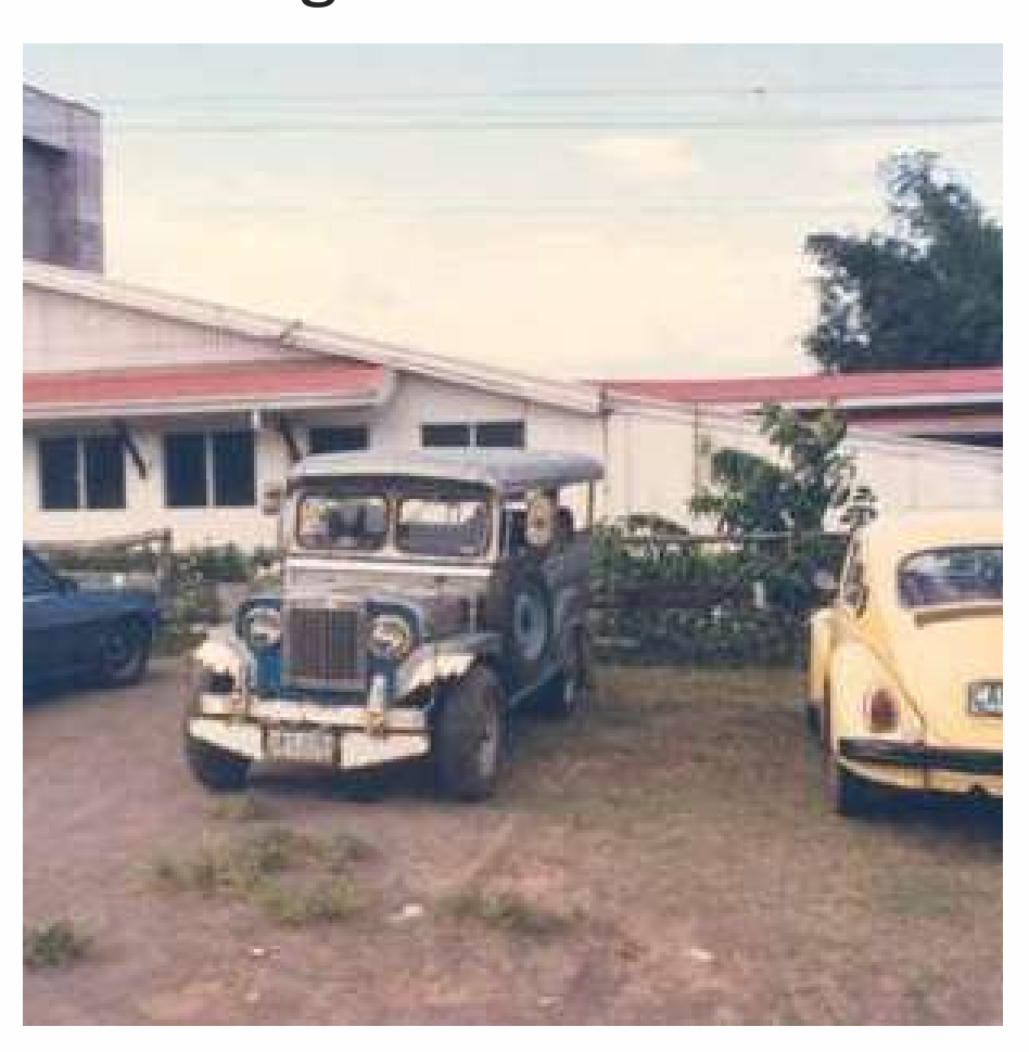
The former OPD Clinic

Over the years, DLSMHSI underwent remarkable growth and transformation, evolving into a beacon of excellence in healthcare, education, and research. From its humble beginnings on the 8.7-hectare main property of DLSMHSI, the Institution consistently has expanded its facilities to include an additional 9.5 hectares as the Annex Property and acquired another 4.8 hectares of new property. This physical expansion reflects the Institution's commitment to meeting the ever-growing demands of its diverse community and advancing its mission.