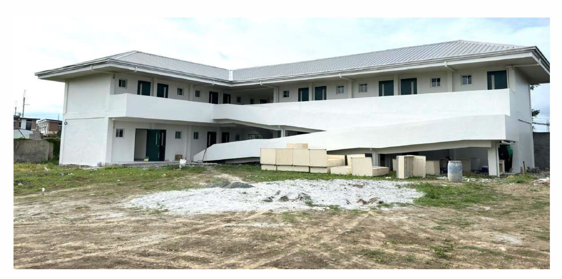
The Isolation Facility