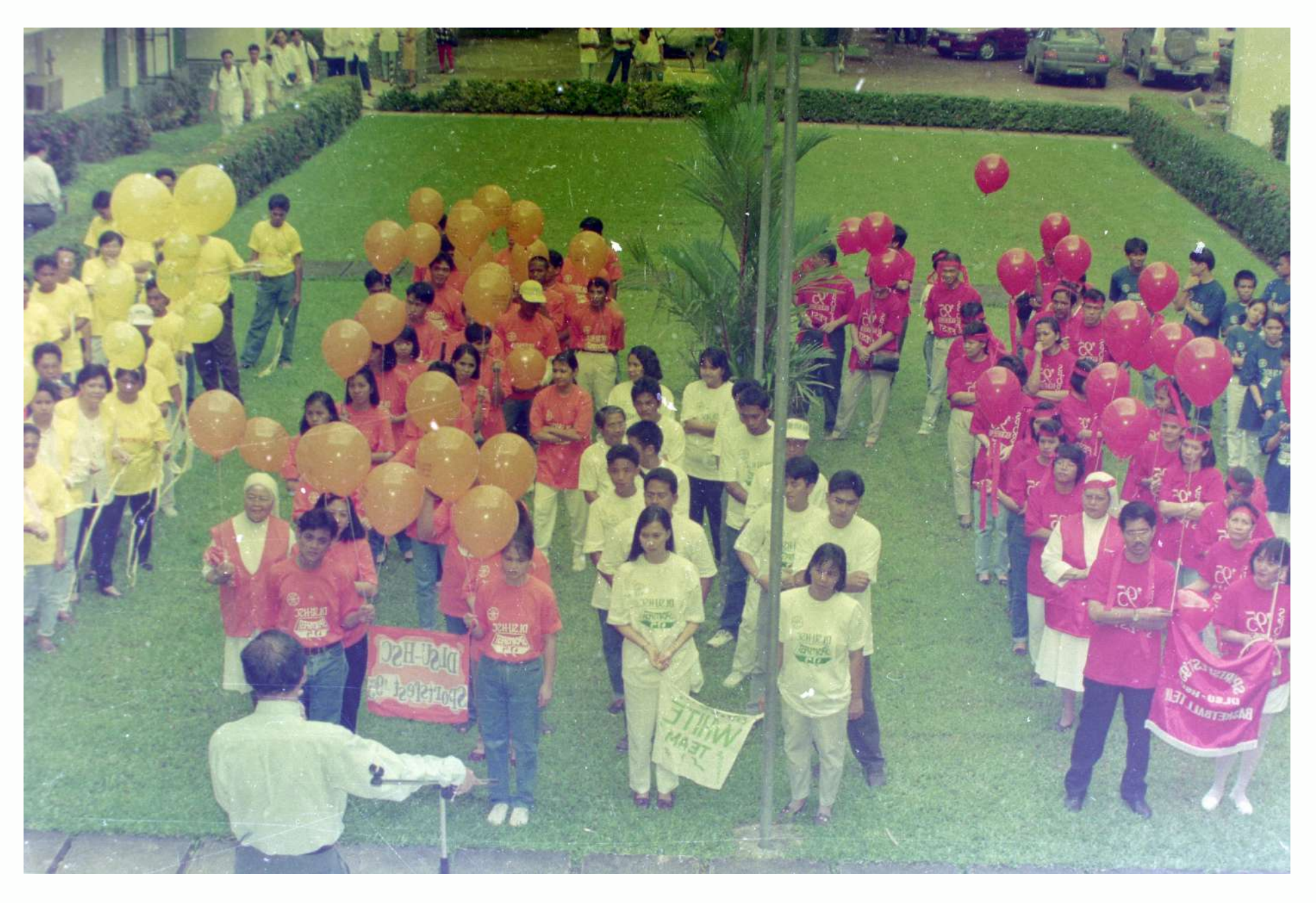
Former Quadrangle Area

DLSMHSI has achieved significant milestones in enhancing its institutional infrastructure, including the complete expansion of the Learning Resource Center (LRC) and the development of LRC Main. Moreover, 88.60% of the additional College of Medicine classrooms have been successfully established. This will allow the Institution to accommodate more medical students for enrollment in the college. The Institution has also achieved the completion of essential facilities, with 100% progress in the Annex Gate and Fence, Health Events Center, and Isolation Facility. Notably, the new Neurodevelopmental Center has reached 87.94% completion, while the Museum of the Human Body stands at 67.47%. Furthermore, progress continues in advancing Dentistry Laboratories, with a completion rate of 15.10%. The majority of the institutional plans have been successfully completed, contributing to the continuous improvement of DLSMHSI's infrastructure and ensuring a conducive environment for education, research, work and healthcare.