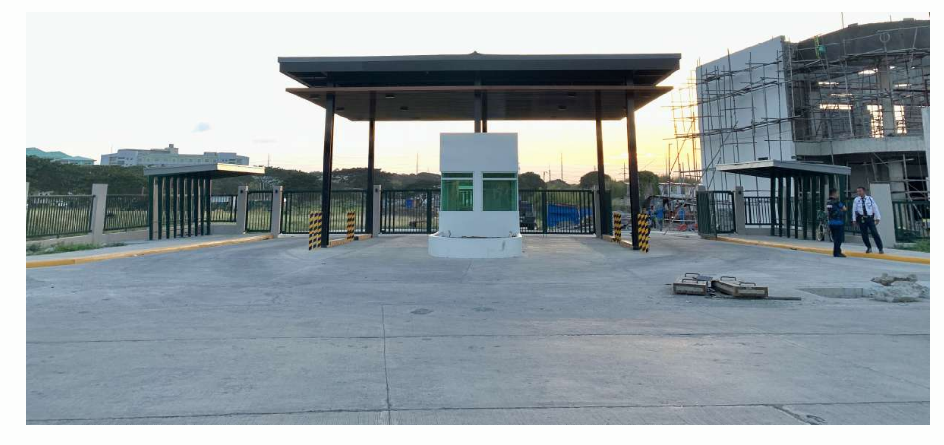
The New Annex Main Gate Entrance

Furthermore, the integration of the Senior High School Building into the Academic Complex represents a great commitment to providing a comprehensive and seamless educational experience for all students. With state-of-thefacilities modern and art amenities, this expansion ensures that learners at every level receive the support and resources they need to excel academically and pursue their aspirations. As we look forward to the completion of ambitious project, this anticipate that the Academic Complex will serve as a hub of innovation, collaboration, and academic excellence, fostering the growth and development of future of leaders generations professionals.