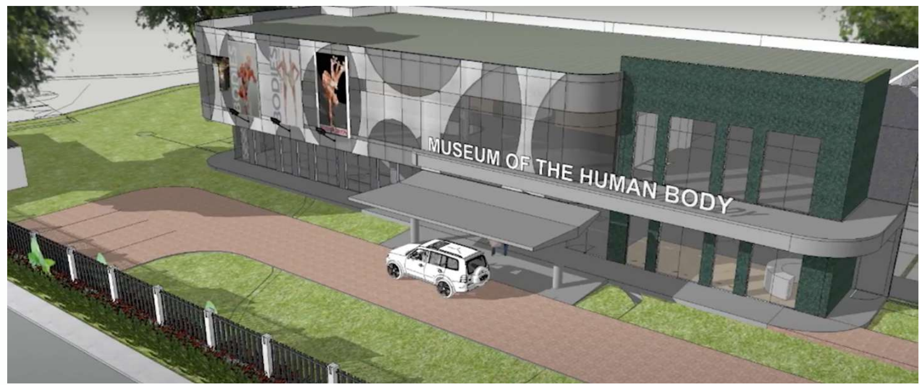
The New Academic Complex