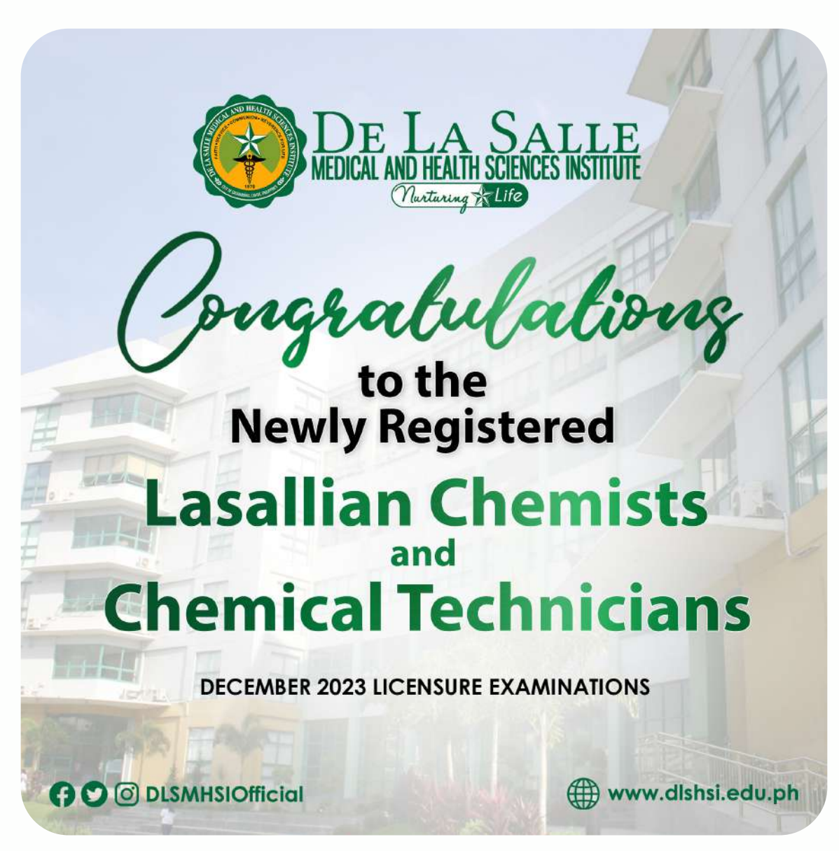
Poster from DLSMHSI Facebook Page