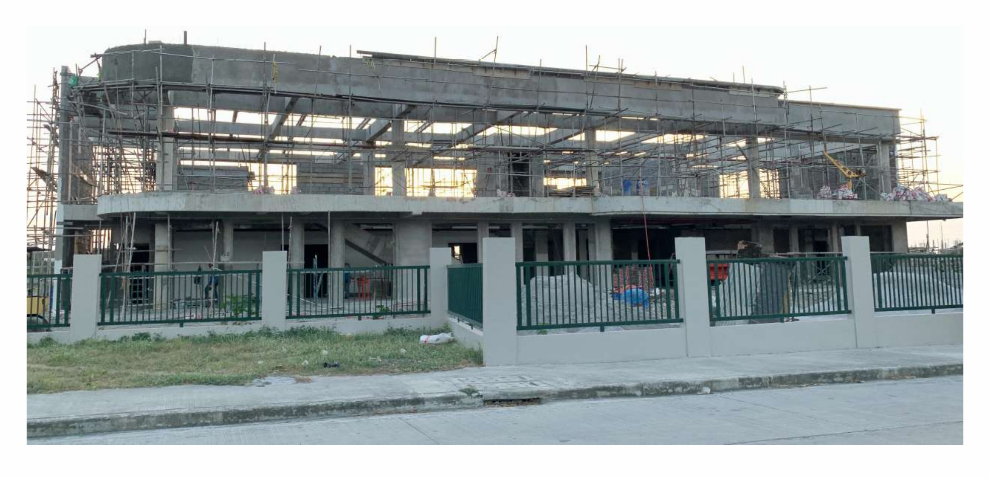
The On-going Construction of the Museum of the Human Body