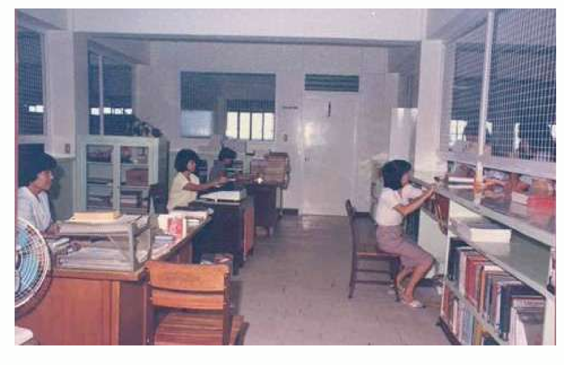
The Old Library at College of Medicine