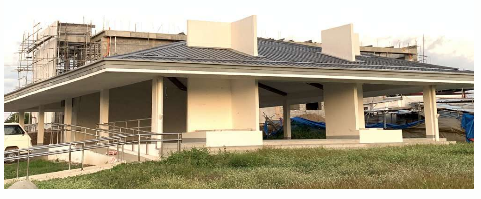
The Health Events Center