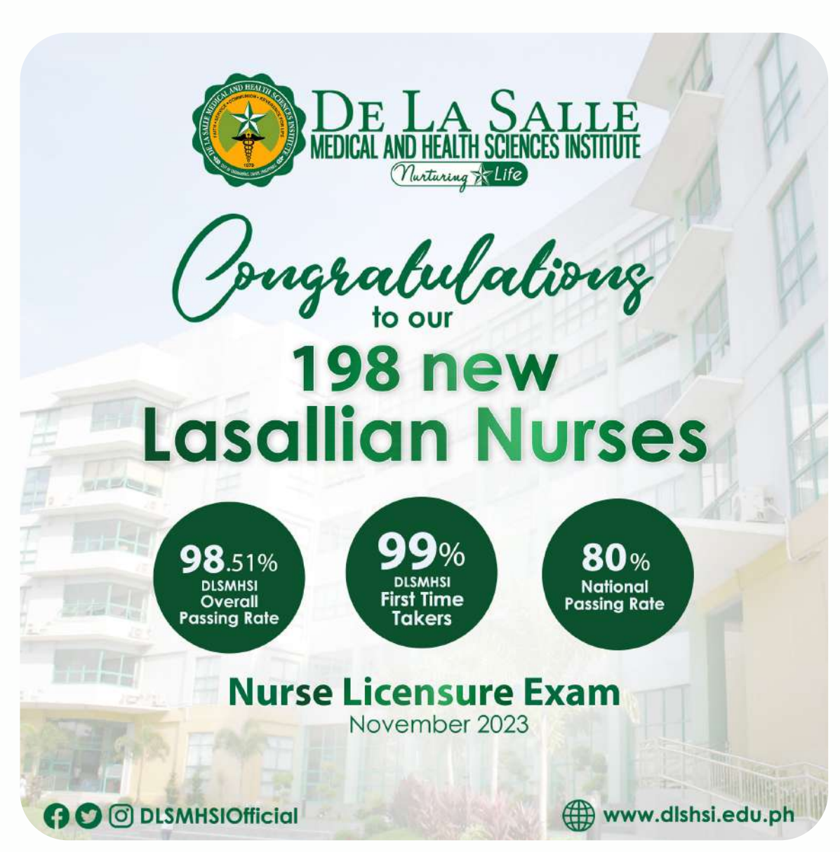
Poster from DLSMHSI Facebook Page