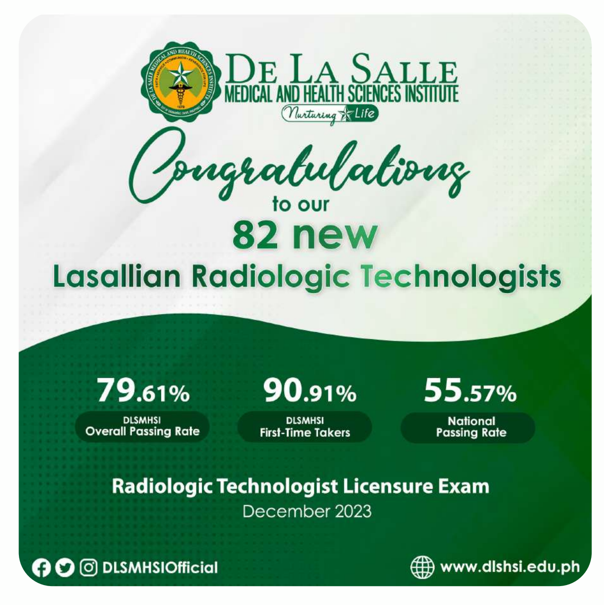
Poster from DLSMHSI Facebook Page