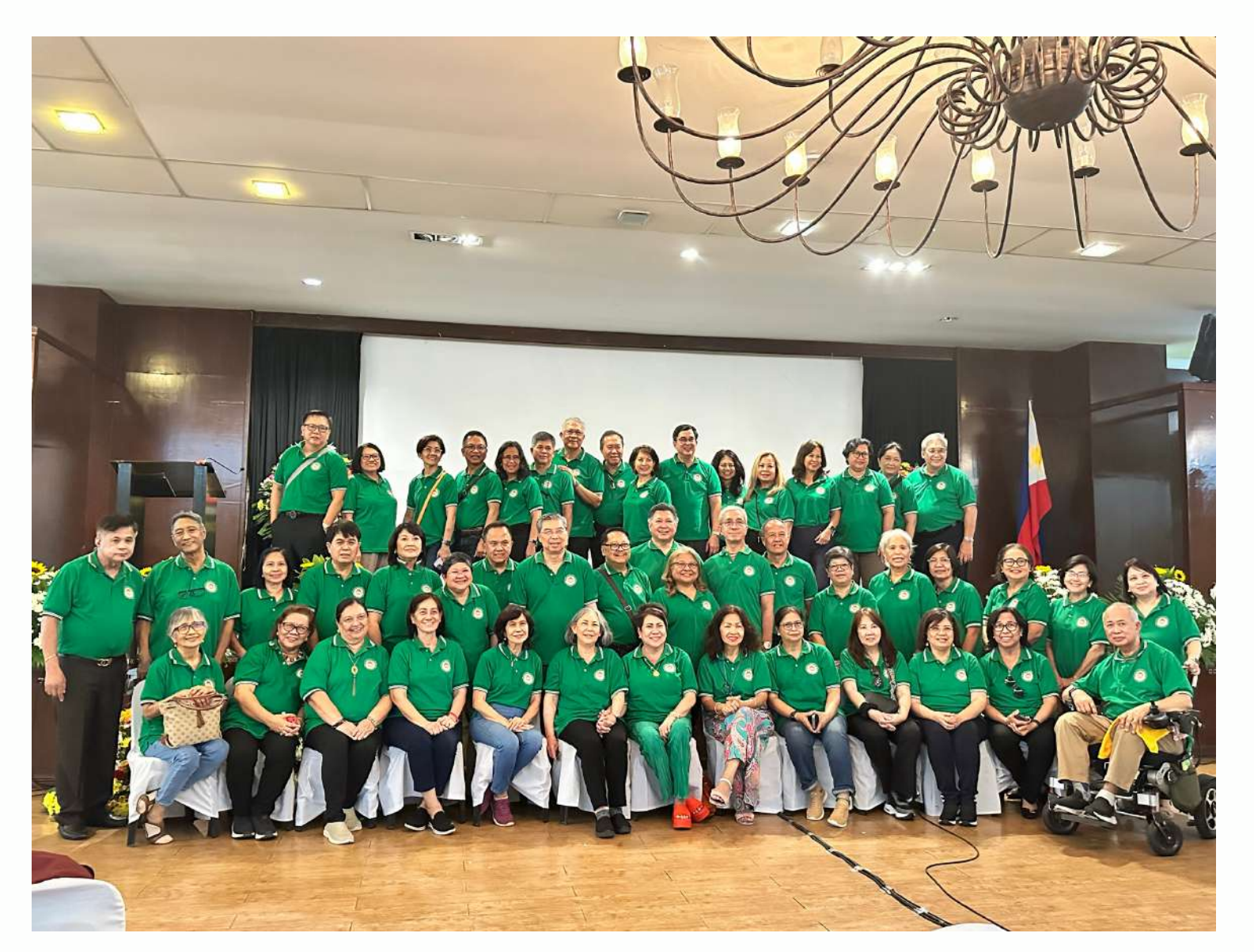
College of Medicine Batch 1983 reunion on December 6, 2023 at De La Salle Medical and Health Sciences Institute- Villarosa Convention Hall