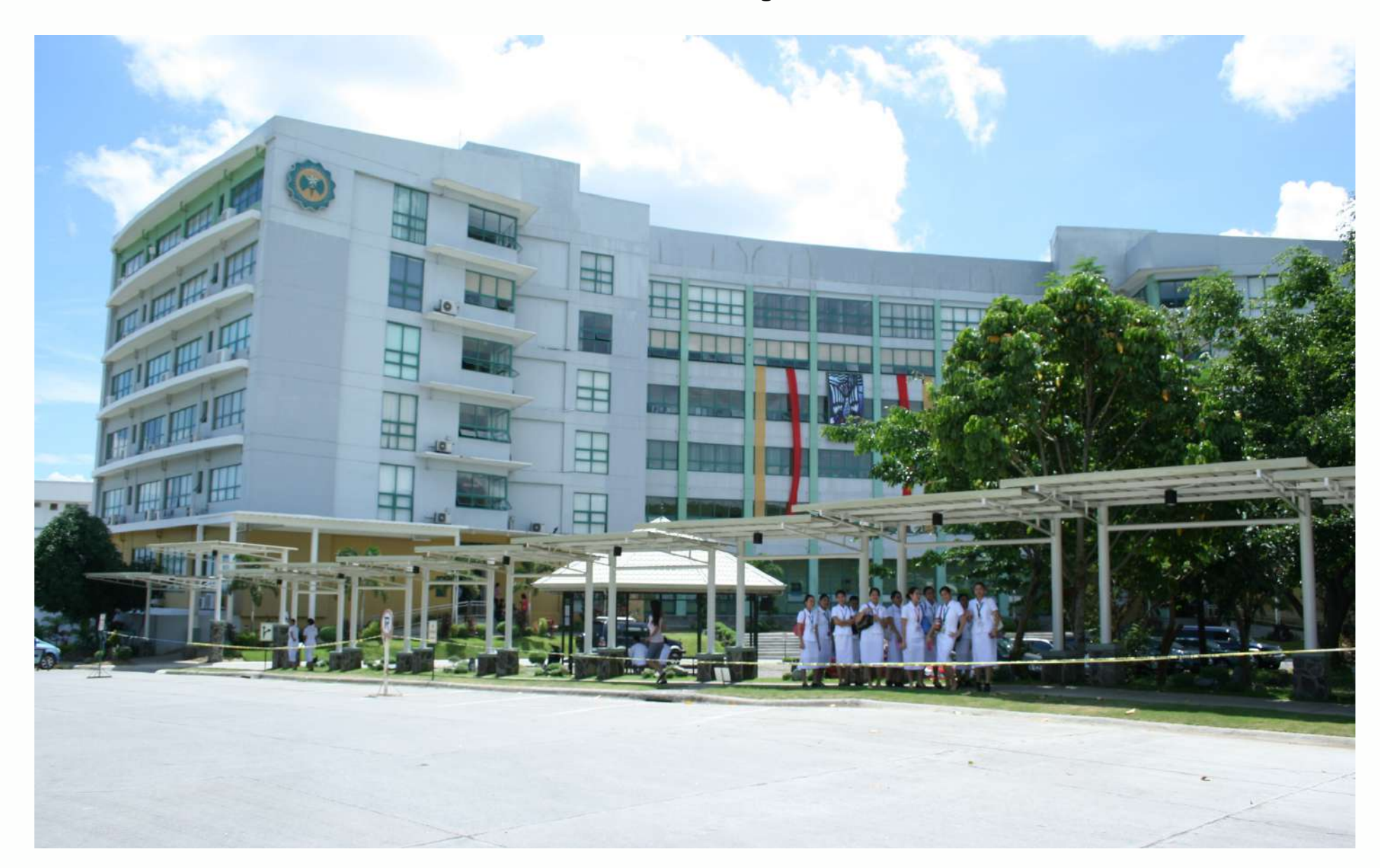
The Wang Building