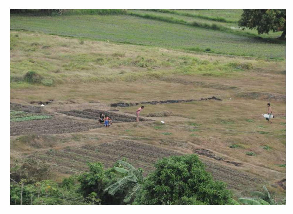
Before Plants Field, Now the location of the Oval